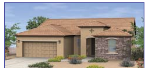
Exterior Design C

2 Bedrooms (Opt. Den), 2 Baths, Great Room, 1665 Sq. Ft.