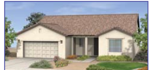
Exterior Design B