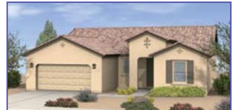
Exterior Design A